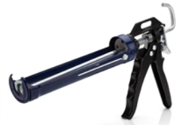
Caulking Gun & Sealant

Preparation: Clean the inside of your gutters thoroughly from leaves, pine needles, debris and dirt. Now would be a good time to water test your gutters and see if it is functioning properly with no leaks as well as making sure the gutters are correctly sloped toward downspouts with no ponding sections.